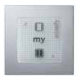
Smoove 1 Open/Close RTS, with open, close, stop and 'My' pre-set favourites.