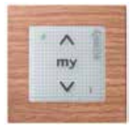
Smoove 1 RTS, single channel with up, down, stop and 'My' pre-set favourites.