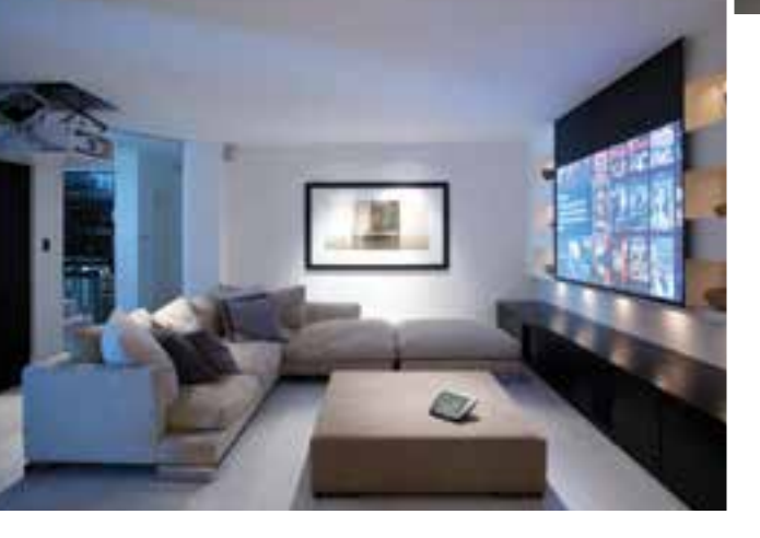
Integrate your Somfy<sup>®</sup> powered blinds with your existing home automation system.

Relax... and enjoy the luxury of modern living.