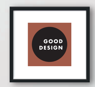
w17 easy full glass sliding door, 2017 Sottezza II conservatory awning, 2017