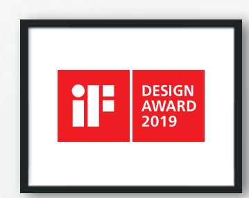
Kubata cassette-awning, 2019 w17 easy full glass sliding door, 2018 Livona open awning, 2015 Opal Design II and Cassita II cassette-awnings, 2014

Timelessly classic or puristically modern – with a weinor product, any outdoor area can be used better and for longer. Numerous design awards bear testimony to our commitment to provide good designs: