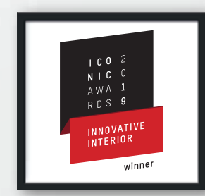
Plaza Viva pergola awning,