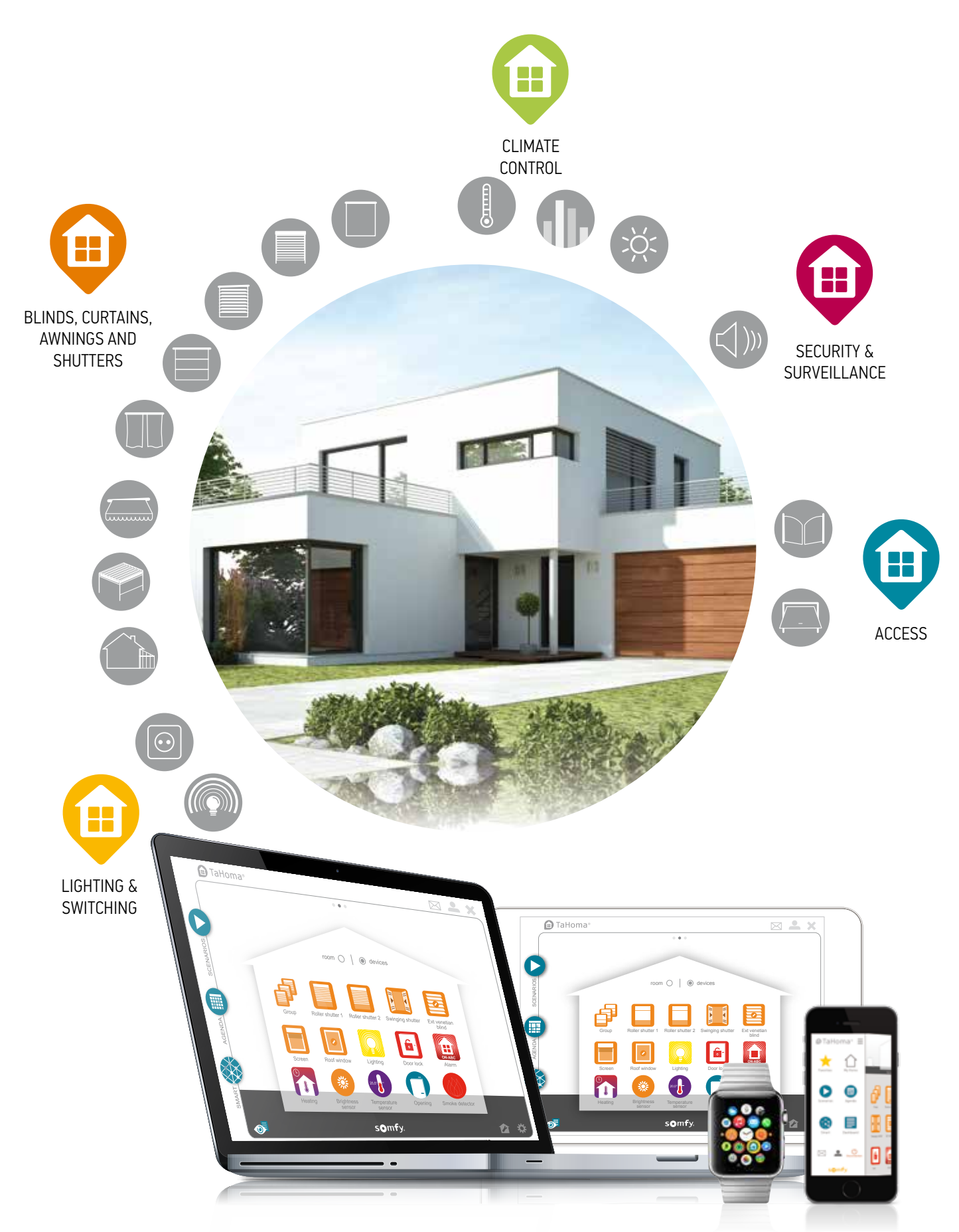
Always connected to your home, wherever you are, from your smartphone, tablet or computer.